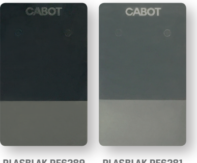
PLASBLAK PE6289 PLASBLAK PE6281

Measurements performed on molded plates made from polypropylene containing 2% titanium dioxide and 1% black masterbatch